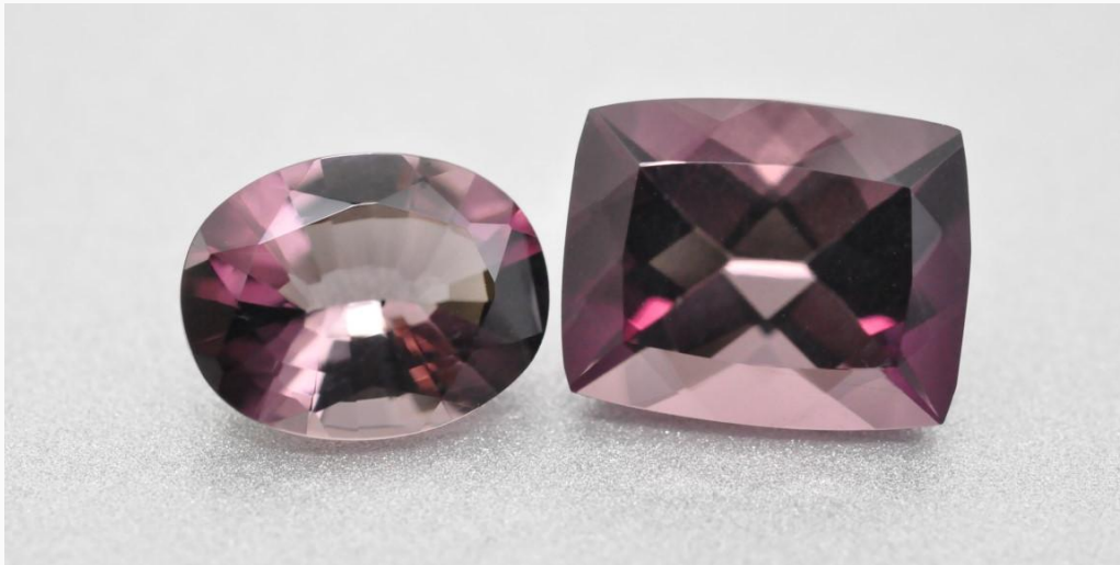
Figure 1: These two brownish purple specimens, a 1.58 ct oval and a 2.95 ct cushion, were identified through gemological testing as scapolite.

Two brownish purple faceted specimens (figure 1) were submitted for identification at the Gem Testing Laboratory, Jaipur, India. The 2.95 ct mixed cushion measured 9.95 \times 8.05 \times 5.88 mm, while the 1.58 ct mixed oval measured 9.07 \times 7.08 \times 4.46 mm. Both were relatively clean to the unaided eye. Based on their color, they were thought to be spinel, but testing soon proved otherwise. Testing yielded the following gemological properties: optic figure—uniaxial; RI—1.549–1.559; birefringence—0.010; and hydrostatic SG—2.63. The material fluoresced a weak orangy red under short-wave UV and was inert under long-wave UV. An absorption band was observed in the yellow-green region using a desk-model spectroscope. In addition, both samples displayed strong dichroism (figure 2) with deep saturated and pale purple colors along the “o” and “e” rays, respectively; this also influenced their face-up color. Under magnification, growth zones and two-directional cleavage planes intersecting at almost 90^\circ were visible. The cleavage planes also contained some fine dendritic films; additionally, the oval specimen had an unidentified brown crystal.